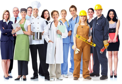
Bingara Central School